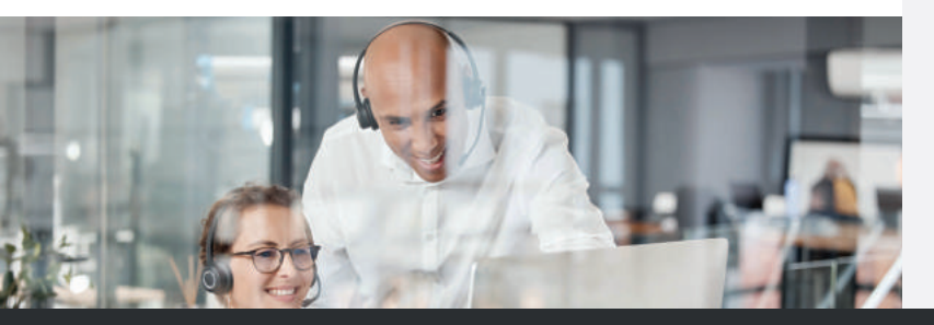
Get in touch: Head office: Brunel Business Park, Jessop Close, Newark, Nottinghamshire NG24 2AG

Our ongoing, managed service for the environment also ensured continued reliability in terms of scalable outcomes and productivity.